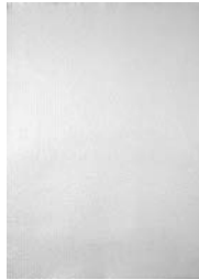
Dane Mitchell Bubble Wrap 2005