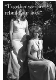
Yvonne Todd Together 2005