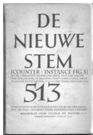
et al De Nieuwe Stem 513 2005