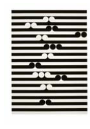
Gordon Walters Tama 1977

FREE NEW ZEALAND ART / 16 MARCH - 16 APRIL 2005 / CURATED BY TOBIAS BERGER DEDICATED TO HARRY