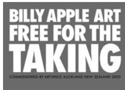
Billy Apple ART FOR THE TAKING 2005